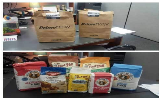
The boyfriend got in trouble yesterday. He sent flours to my office today to apologize...