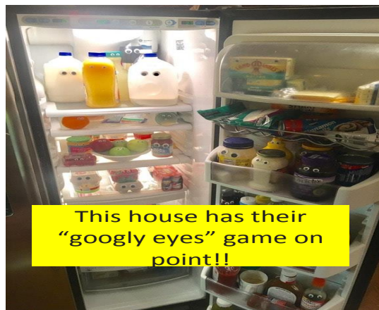
This house has their "googly eyes" game on point!!