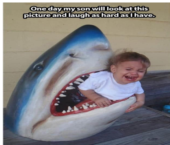
One day my son will look at this picture and laugh as hard as I have.