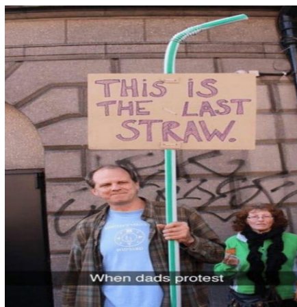
When dads protest