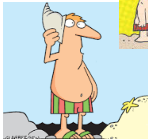
"I don't bring my work phone on vacation. If it's an emergency call me on my shell!"