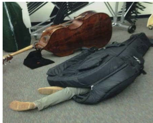
PEOPLE THAT ARE COMFORTABLE IN THEIR OWN SKIN!

"This 6:00 am orchestra practice is for the birds..."