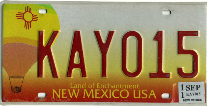
Many people are under the impression that a trip to New Mexico requires a U.S. passport. New Mexico is the only state in the Union that actually put "USA" on its license plates for the sake of identity.

Since New Mexico's climate is so dry 3/4 of the roads are left unpaved. The roads don't wash away.