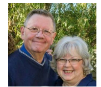
Don Nickles President