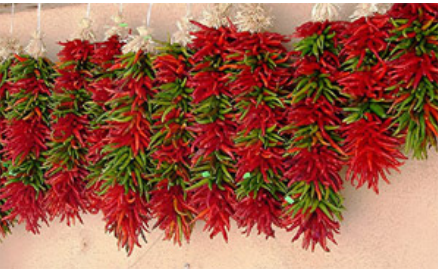
New Mexico has two designated State Vegetables - Chile and frijoles. New Mexico also has an officially designated State Question -- "Red or green?" (referring to chile preference)