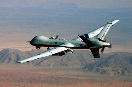
Currently, New Mexico is the only state with a facility that the Federal Aviation Administration has approved for testing drones.

In some isolated villages, such as Truchas, Chimayo', and Coyote in north-central New Mexico, some descendants of Spanish conquistadors still speak a form of 16th century Spanish used no where else in the world today.