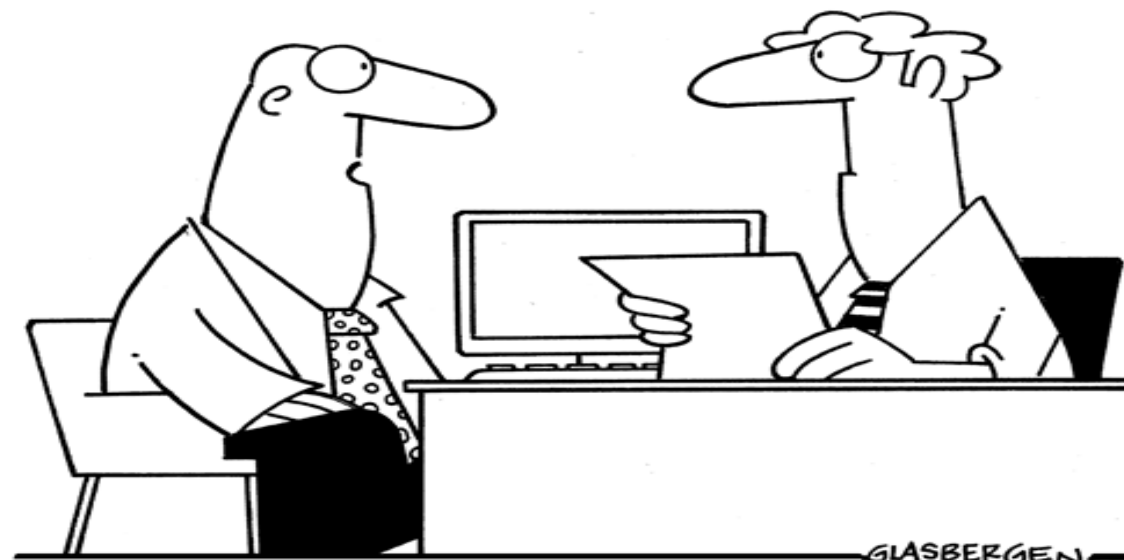
"Can I write off last year's taxes as a bad investment?"